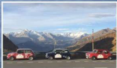
THE ITALIAN JOB RETURNS