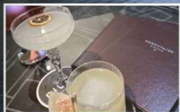
COCKTAILS AT THE DILLY

Sailing through the Norwegian Fjords onboard Iona.